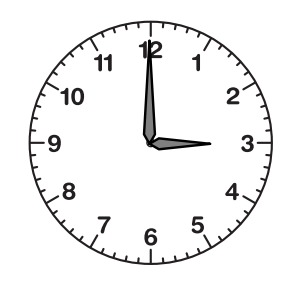
The time is 3:00 .